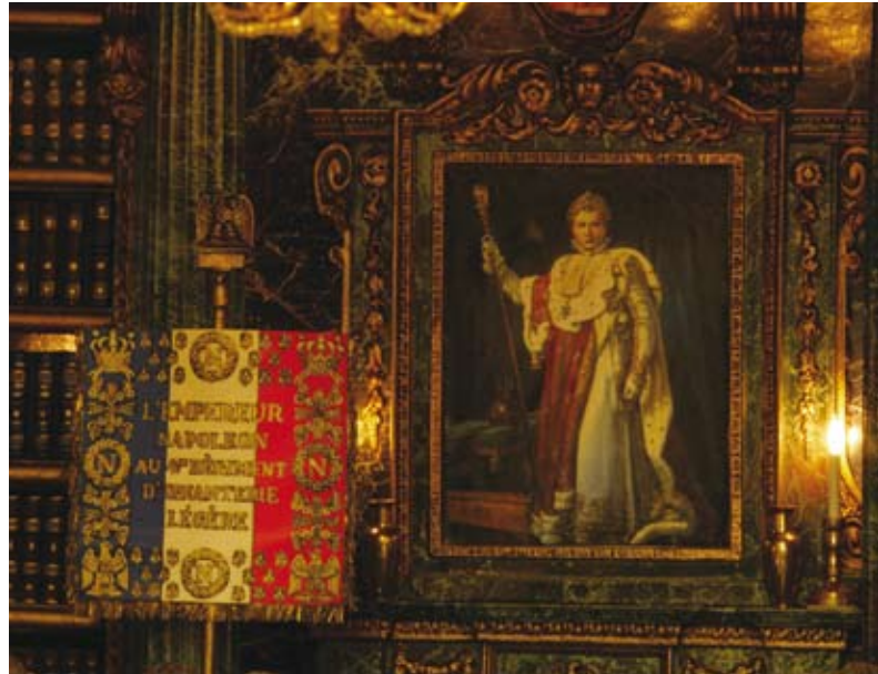
Over the fireplace is a painting of Napoleon in his coronation robes taken from a picture in a book and copied down to size. An eagle and infantry banner stand to the left side of the huge ornate fireplace.