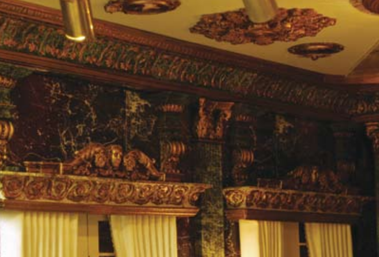
ABOVE LEFT: Tiny spotlights controlled by rheostats enhance the ceiling and coving details down to the sumptuously adorned pelmets over the window draw curtains. Most of the relief detail throughout the diorama was mastered by Bob and cast in resin. ABOVE RIGHT: The chandelier with candles hangs from the centre of the ornate ceiling. Again, the candles are controlled by rheostat.