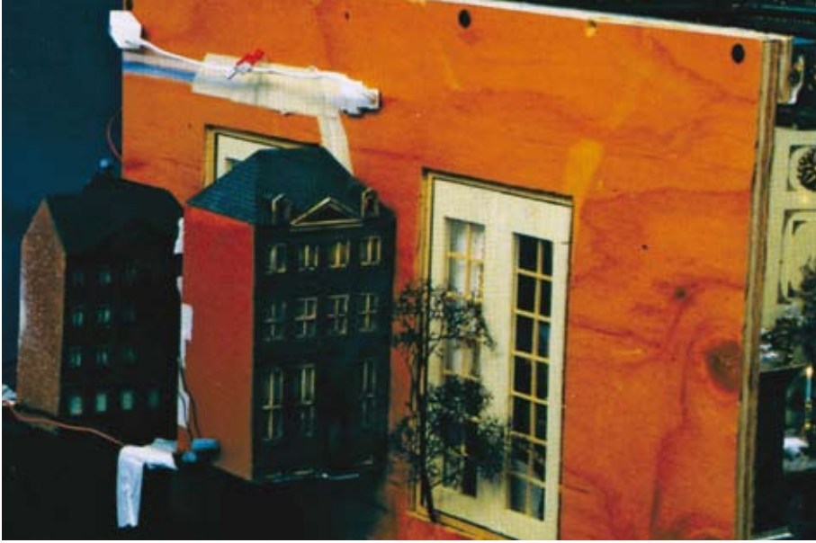
HO scale buildings attached to the left side of the outer wall are lit and their windows show through the windows when viewed from inside. The miniature 'tree', a natural twig, fixed just outside the window gives the impression that it is some distance away.