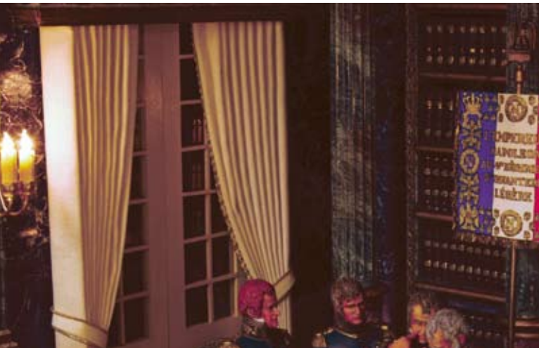
In this view, the lit windows in those small HO buildings positioned outside of the rear window to create the illusion of buildings opposite Napoleon's office can just be seen. It is difficult to get a camera in for such a picture with the lighting working and the ceiling in place, but the effect can be seen by the viewer with the shadow box closed down – as Bob intended.