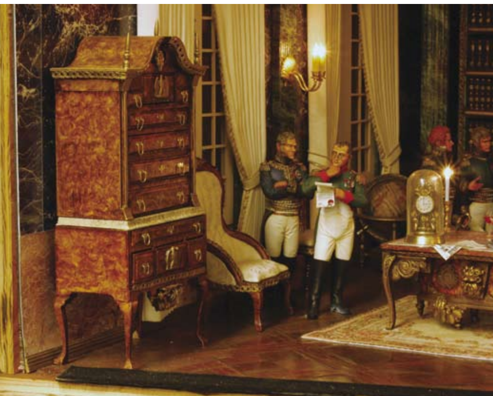
BELOW: The furniture was adapted and modified from kits in dolls house suppliers' ranges. Each was given a burr walnut finish by base coating with flesh acrylic followed by a coat of Burnt Umber oil paint then, after an hour, three coats of Humbrol Clear applied with a broad clean brush in swirls. The Humbrol Clear 'eats' through the Burnt Umber to the flesh acrylic undercoat to produce the scale effect here. This view is lit to show the effect which otherwise would not be clear through the front panel when fitted.