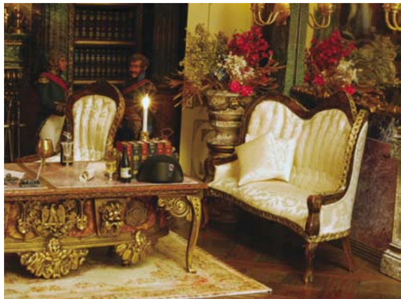
ABOVE: The small settee in front of the mirror, like most of the other matching pieces, was assembled from kits of furniture items on sale in stores specializing in dolls houses. In the background Marshal Lefebvre receives an aide bearing possibly another abdication ultimatum for the Emperor.