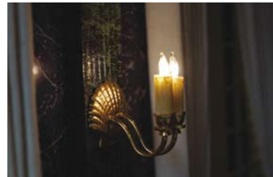
The wall mounted candleholders, like the candlesticks and chandelier are dolls house fittings with miniature grain of wheat bulbs adapted to this diorama and controlled by rheostats.

correct, making the switch from Second World War Allied and Axis figures that he knew so well was really a challenge to him. For a 'first attempt' I think he made a good job of them and they fit so naturally into the scene he created for them.