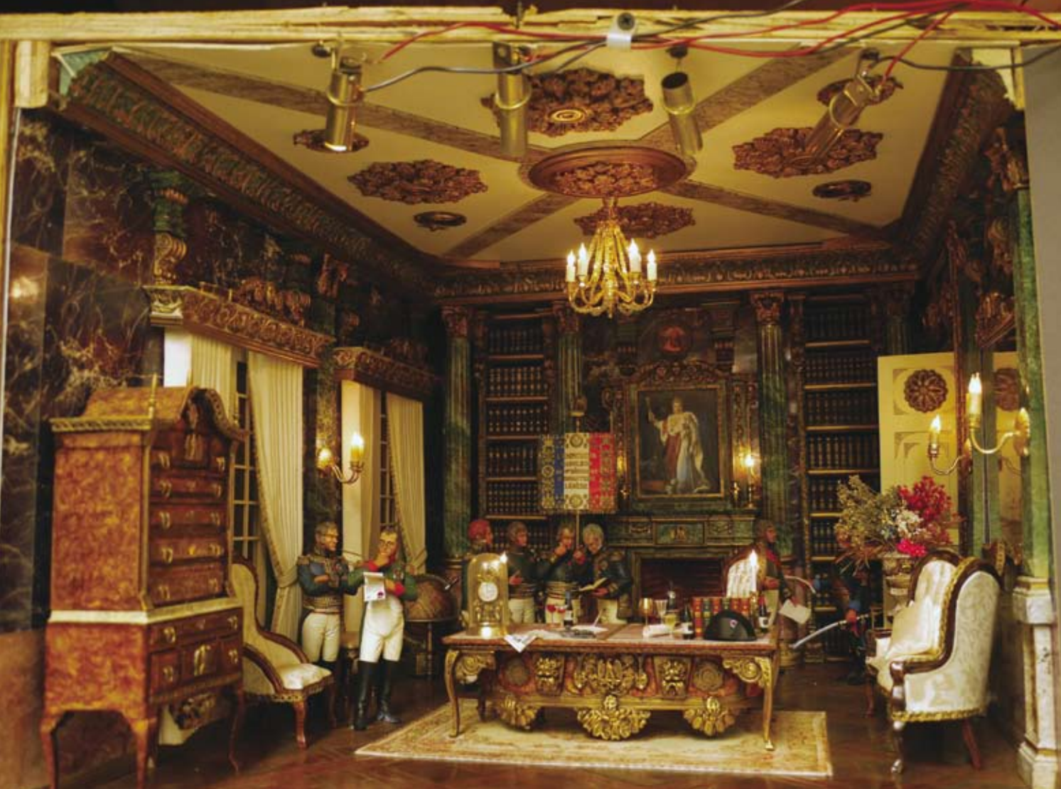
ABOVE: The interior exposed! Except for the miniature spotlights in their brass tubes above the top edge – this is the panoramic view of the room at Fontainebleau, and lit for this photograph rather than as it would be under the diorama's special effects lighting. BELOW LEFT: One of Bob's photos of the shadow box before it was installed – he admits it's not pretty and is not seen when the unit is in place. Efficiency and reliability are the key words for any lit boxed diorama. The small white box is the back of the fireplace that contains the pulsating circuits for the flickering fire effect within. Round the back are two HO railway buildings with internal lighting so their windows appear distant looking out through the windows inside the room. Two of the transformers for the lighting are on the left. BELOW RIGHT: The base and room is constructed from plywood. Note that the room, viewed from above with its ceiling removed, is set at an angle to the viewer through the decorative border viewing frame to produce good perspective of the room. The small spotlights used are controlled by the four rheostats in the wooden panel on the right.