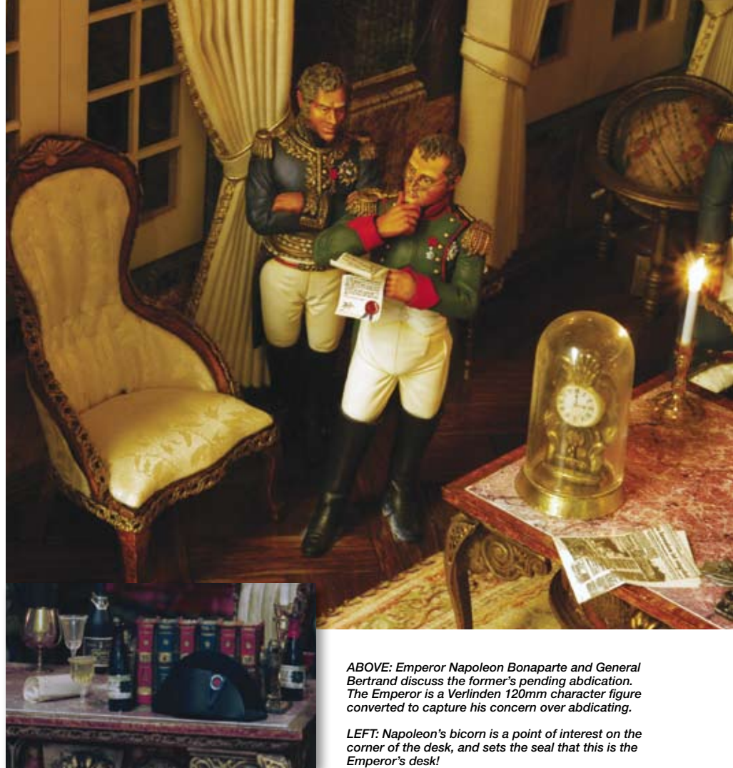
ABOVE: Emperor Napoleon Bonaparte and General Bertrand discuss the former's pending abdication. The Emperor is a Verlinden 120mm character figure converted to capture his concern over abdicating.

Bookcases were made in basswood and trimmed with cuttings from ornaments in the Sue Cook range. Masters for sections of books were made up from basswood and solder wire for binding detail on their spines, before casting off plenty in resin to fill the available spaces of Napoleon's library.