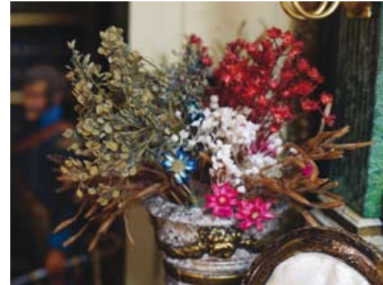
The miniature arrangement of dried flowers in their stand near the mirror adds a splash of colour to the area near the door.