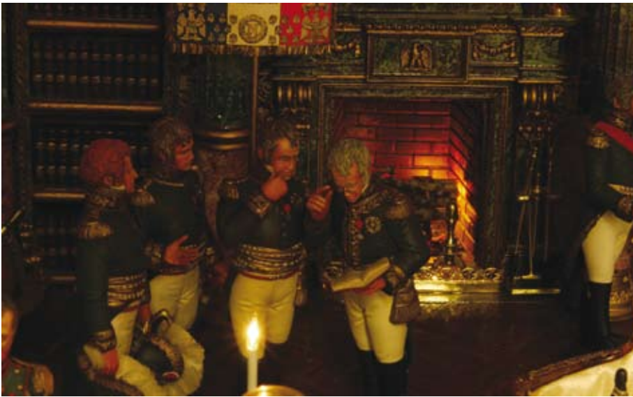
ABOVE: The lighting via miniature spotlights and the grain of wheat bulbs in the candles is controlled to produce the correct lighting that could be expected from the glow of the fire and the candles positioned around the room – warm looking around the Marshals in the candlelight with the fire adding warmth to the scene from behind them.